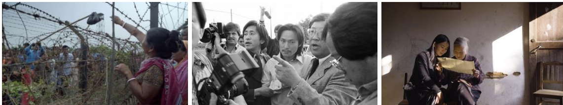
Borderlands, Free Choi Soo Lee, Hidden Letters