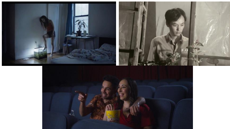
Actual People, A New Old Play, Tehranto