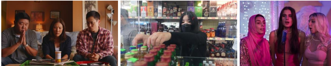
Dealing With Dad, Liquor Store Dreams, Sonne